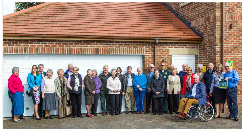
Group photo of Defibrillator Launch